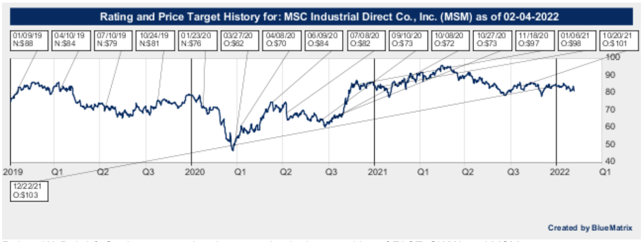
Robert W. Baird & Co. Incorporated makes a market in the securities of FAST, GWW, and MSM.