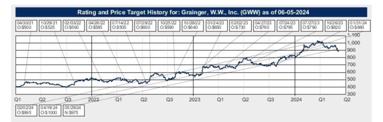
Created by Blue Matrix