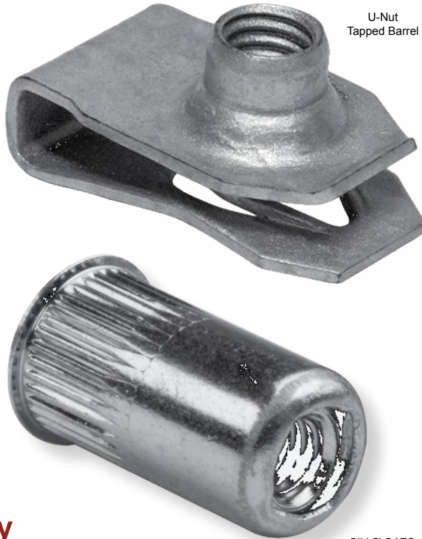
U-Nut Tapped Barrel