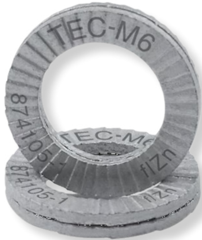
Reusable Locking Washers

For Automotive & Commercial Vehicles, White Goods, & Industrial Applications