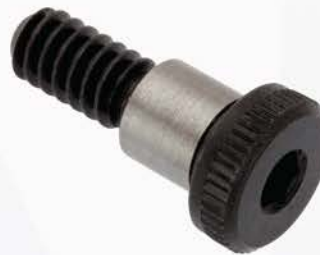
Low Profile Knurled Head