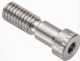
Oversized Extended Thread Knurled Head