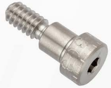
Left Hand Threaded Knurled Head