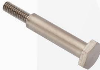
External Wrench Hex Head