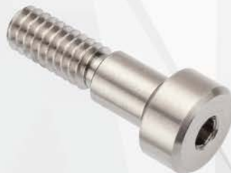
Extended Thread Smooth Head