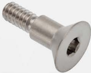
Flat 82° Head