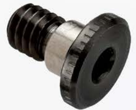
Ultra Low Profile Knurled Head