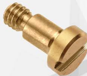
Low Profile Smooth Head