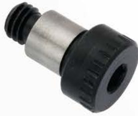
Shortened Thread Knurled Head