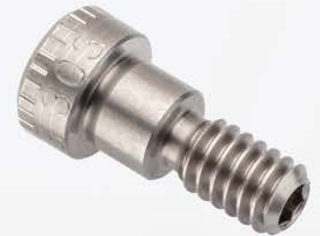
Double Drive Knurled Head