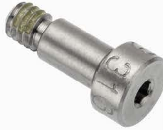
Self-Locker Knurled Head