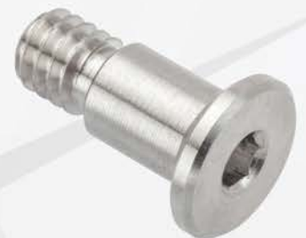
Ultra Low Profile Smooth Head

Materials: 17-4, 18-8, A286, 316, 316H5®, 410, 416 Stainless Steel Alloy 4140 | Aluminum | Monel | Stressproof Steel 1144 | Titanium Gr2 | Titanium Gr5