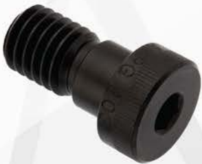
Oversized Thread Knurled Head